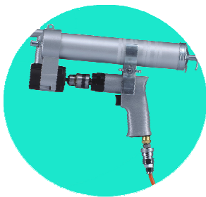
Pneumatic Drill : 3/8" & 1/2" Chuck