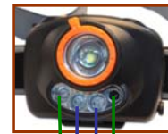
2 Red Ø5mm LED