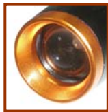
Super Bright 1W LED