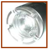
XPE 1W LED