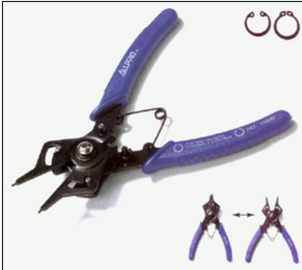
Model No. HP0254