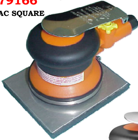
PT779166 NON-VAC SQUARE