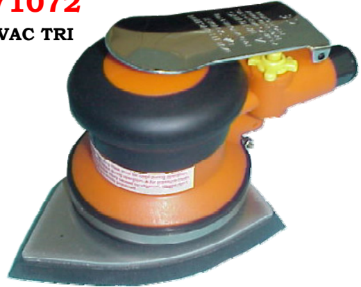
PT71072 NON-VAC TRI