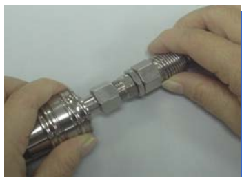
2nd Step: Pull the sleeve to disconnect the nipple