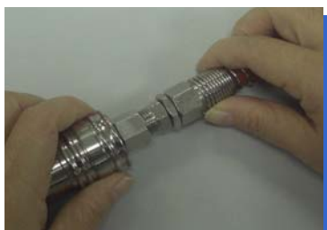
1st Step: Pull the sleeve to release air