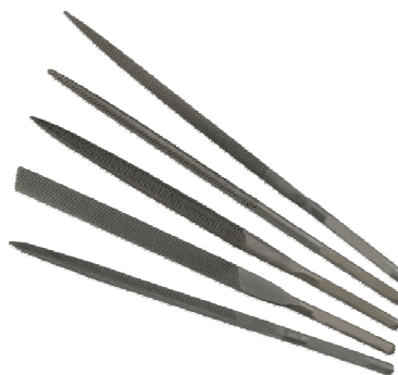
File- Shank Dia. 4mm Rectangular, Half Round, Round, Triangular, Square