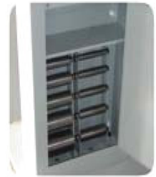
CABINET STAND WITH ROLLER HOLDER

Optional Roller Size: φ 20mm, φ 26mm, φ 28mm, φ 32mm, φ 42mm, φ 48mm, φ 60mm, φ 76mm.