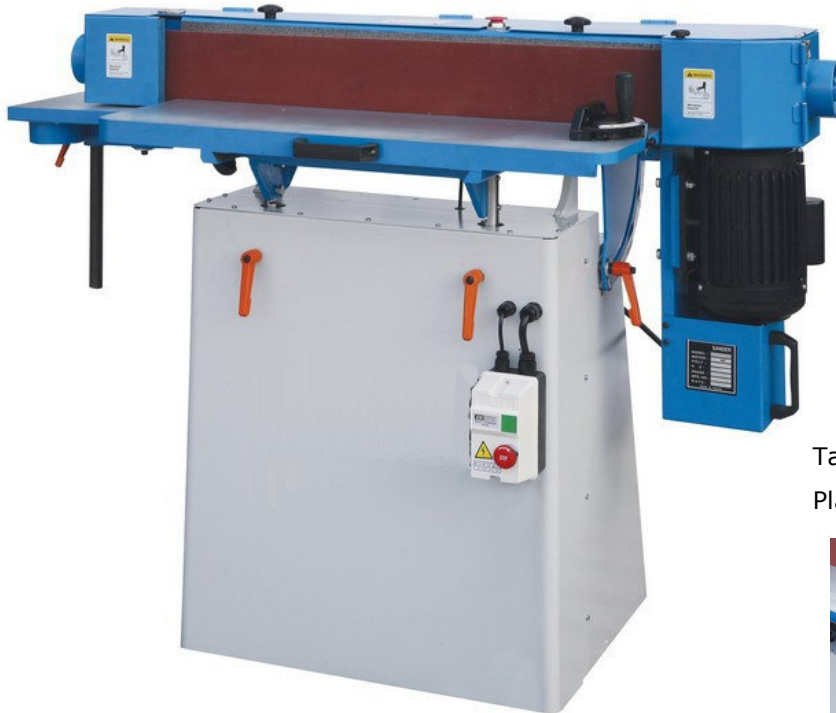
Table can move up and down. Platen can tilt 0° to 90°