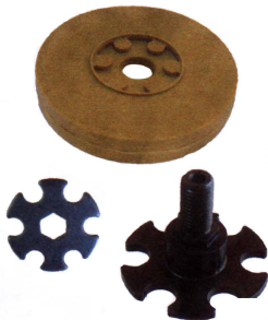
APT381534D DISPOSABLE ERASER PAD SET

DIAMETER :..... 3-1/2" (88mm) MAX. SPEED : ..... 4000 RPM SPINDLE THREAD: ..... 5/16" - 24 TPI"