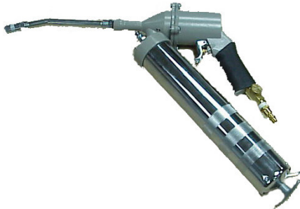
PT2063 COUNTINUOUS AIR GREASE GUN

CARTRIDGE LOADING:..... 14oz HOSE SIZE (I.D.): ..... 3/8" AIR INLET SIZE: ..... 1/4"