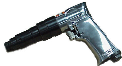
PT40402 TORQUE EXTERNAL ADJUSTABLE CLUTCH AIR SCREW DRIVER

SHANK HEX:..... 6.35 mm TORQUE RANGE: ..... 45-115 in-lbs FREE SPEED: ..... 1800 R.P.M. HOSE SIZE (I.D.): ..... 3/8" AIR INLET SIZE: ..... 1/4"