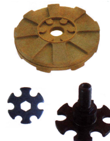
APT381534R DISPOSABLE ERASER PAD SET VENTILATING TYPE

DIAMETER :..... 3-1/2" (88mm) MAX. SPEED : ..... 4000 RPM SPINDLE THREAD: ..... 5/16" - 24 TPI"