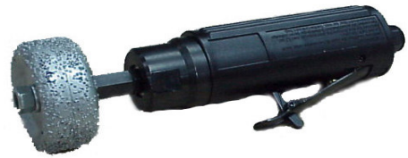
PT38142 AIR TIRE BUFFER (W/O BUFFING WHEEL)

FREE SPEED: ..... 4000 R.P.M. EXHAUST: .... REAR HOSE SIZE (I.D.): ..... 3/8" AIR INLET SIZE: ..... 1/4"